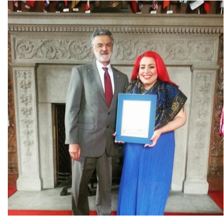
Proclamation by The City of Cleveland in recognition of The Ohio Burlesque Festival 2015. Pictured Mayor Frank Jackson.