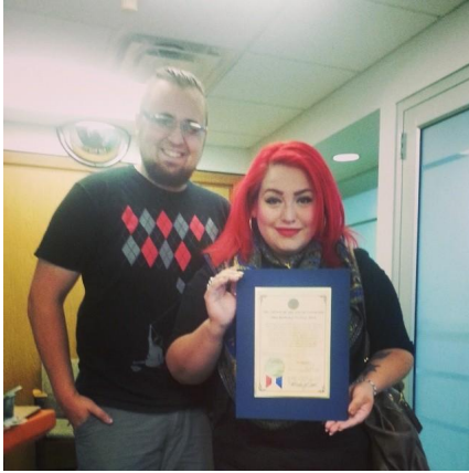
The Cleveland City Council Recognition Scroll to The Ohio Burlesque Festival 2014